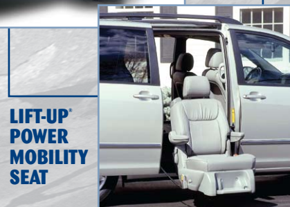
LIFT-UP™ POWER MOBILITY SEAT