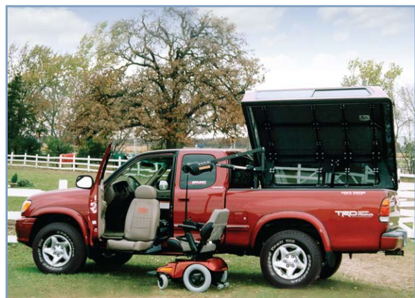
OUT-RIDER™ LIFT W/ POW'R TOPPER™ AND TURNY ORBIT PACKAGE