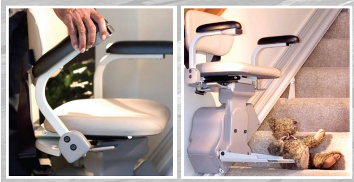
The arms flip up and out of the way for easy wheelchair transfer.

Using two 12-volt batteries that are powered by an unobtrusive battery charger plugged into a standard household outlet, the Electra-Ride LT features strip charge contacts for more flexibility when parking. You have access to your upstairs and downstairs, even if electrical service in your home is interrupted.