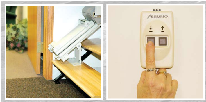
Folding rail option allows full clearance to doorways or hallways without rail obstruction.