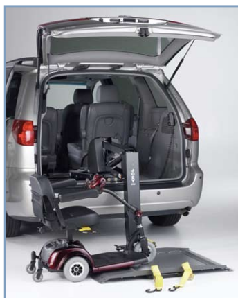
JOEY™ INTERIOR PLATFORM LIFT VSL-4000