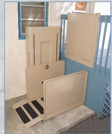
VERTICAL PLATFORM LIFT