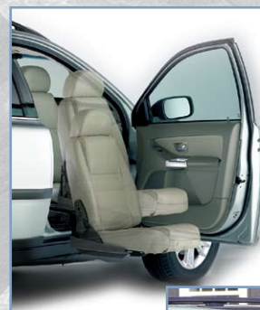
TURNY™ ORBIT™ SEAT

Revolutionary Turning Automotive Seating™ (TAS™)