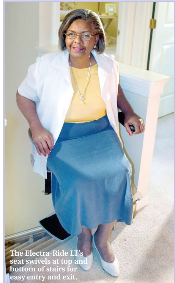
The Electra-Ride LT's seat swivels at top and bottom of stairs for easy entry and exit.