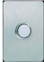
Figure 2: Hall Call

In the event of a building power failure, the door system is provided with a temporary power back-up system to continue the opening operation for a number of times. On resuming normal building power, the back-up system will turn OFF and begin automatic recharging.